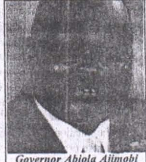
Governor Abiola Ajimobi

Meanwhile President Goodluck Jonathan on Thursday vowed total war against terrorism as the country's security forces stepped up efforts to rescue more than 200 schoolgirls kidnapped by Boko Haram Islamists 46 days ago. (Continued on page 5)