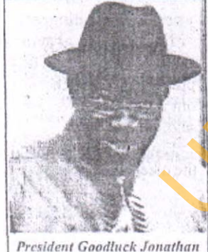
President Goodluck Jonathan

"The masses of Oyo State are tired of the apparent misrule of the incumbent administration which has refused to put smiles on their faces and are ready to vote it out," he declared.