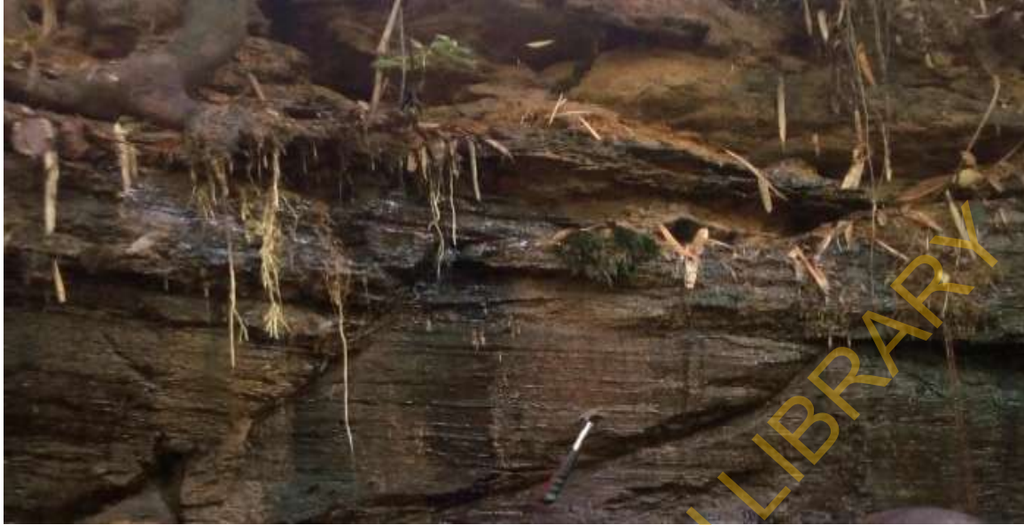
Plate 1. Geological setting showing beddings and faults of the rock exposures.

Method (VLF – EM) is to qualitatively delineate the conductive zones and non-conductive zones in the study area. Graphic software, VELFAN 1.0 developed by Alberg Services Nigeria Limited (Geophysical Consulting Services), in MATLAB graphical user interface was used to plot the filtered imaginary and real Very Low Frequency- Electromagnetic curves. High positive values indicate presence of conductive subsurface structures while low or negative values are indicative of resistive formations, (Sharma and Baranwal, 2005).