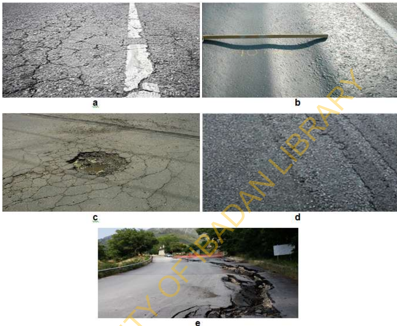
Figure 1. (a) Alligator cracking; (b) Rutting at wheel path; (c) Potholes; (d) Ravelling; (e) Block cracking.

WADI instrument was used to obtain electromagnetic-Very Low Frequency (VLF) field data, while ABEM resistivity meter was used to obtain electrical resistivity field data. The use of electromagnetic method was preliminary survey along the three locations with traverses measuring 210, 600 and 140 m, respectively. The EM-VLF data were interpreted using the VLF Graphic software, VELFAN 1.0 double plot of filtered real and filtered imaginary against distance. For the electrical resistivity method, two techniques were used, namely, the Vertical Electrical Sounding (VES) using Schlumberger configuration with AB/2 ( AB/2 = Current electrode spacing) varying from 1 to 100 m. A total of 42 VES stations were occupied, which include 10, 25 and 7 VES stations at the three studied locations, respectively. 2-D Electrical Resistivity Tomography (ERT) using dipole-dipole configuration with inter station separation (a) of 10 m, an expansion factor (n) that varied from 1 to 5 was also carried out. The VES data obtained were interpreted using IP 2 Win Software and layer parameters such as true resistivity and thickness were determined. The geoelectric parameters were used to generate the concept of Dar Zarrouk second order (Maillet, 1974) parameters (transverse unit resistance,