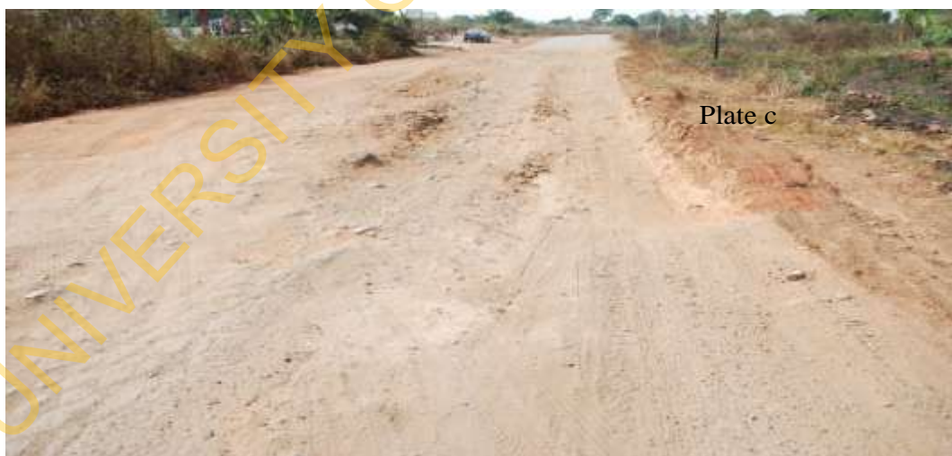
Plate 2. (a) Failed Section at Locality 1; (b) Failed Section at Locality 2; (c) Failed Section at Locality 3.

interpretation becomes a difficult task. Such situation requires the formulation of better analysis technique of interpretation for the existing data to yield useful and easily understandable solution to differentiate among